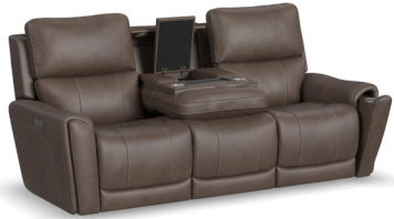
-63PH POWER RECLINING SOFA WITH CONSOLE, POWER HEADRESTS & LUMBAR