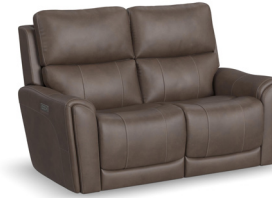
-60PH POWER RECLINING LOVESEAT WITH POWER HEADRESTS & LUMBAR