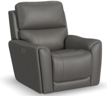
-50PH POWER RECLINER WITH POWER HEADREST & LUMBAR