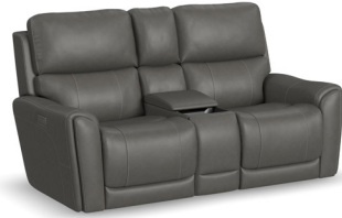
-64PH POWER RECLINING LOVESEAT WITH CONSOLE, POWER HEADRESTS & LUMBAR